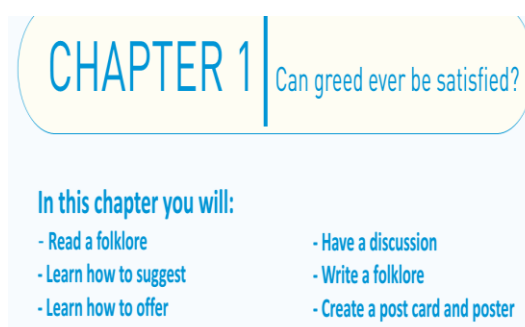
Figure 1. The Screenshot of the Reading Aim

These experiences involve understanding the purpose for reading and building a knowledge base necessary for dealing with the content and the structure of the material. Therefore, the aims of learning that are stated in each chapter of the students' English textbook also the personal and genre connection in that textbook guide the students to know what kind of materials that are going to be learned, connecting the students' background knowledge with the materials, and building the students' knowledge about the materials that are going to be learned. The screenshot of the first and the second sub-indicators for the reading aims can be seen below: